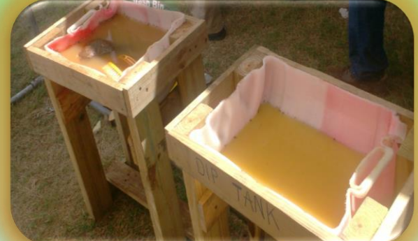
Wash bin and dip tank