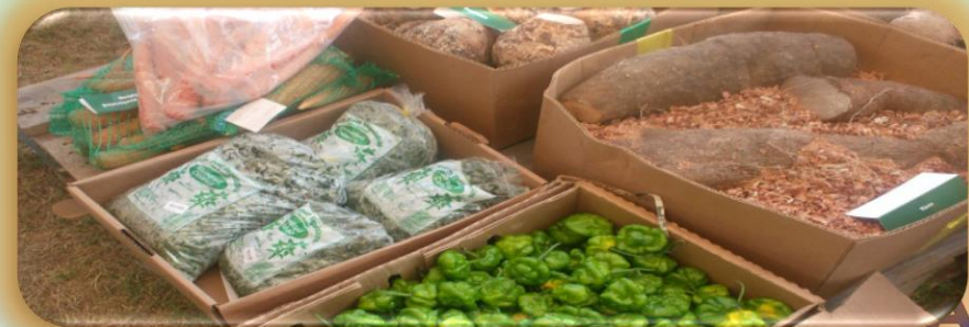
Packaged fresh produce