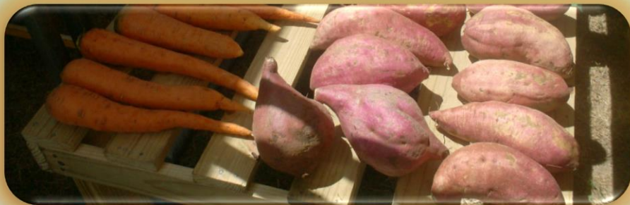
Sweet potatoes & carrots on drying rack