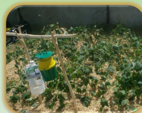
Sweet potato weevil trap in field