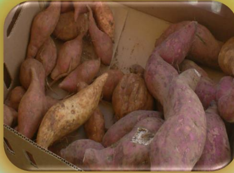
Sorting harvest – not fit for export