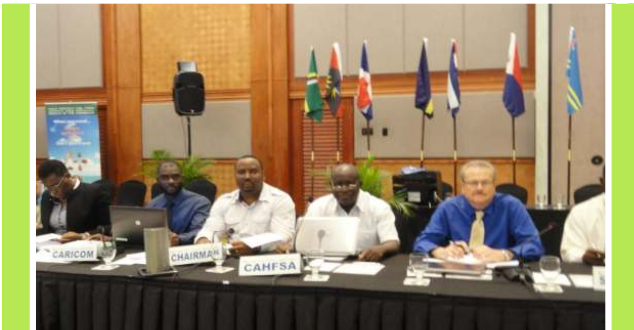
Figure 11: CEO of CAHFSA attending CARICOM Plant Health Directors Meeting