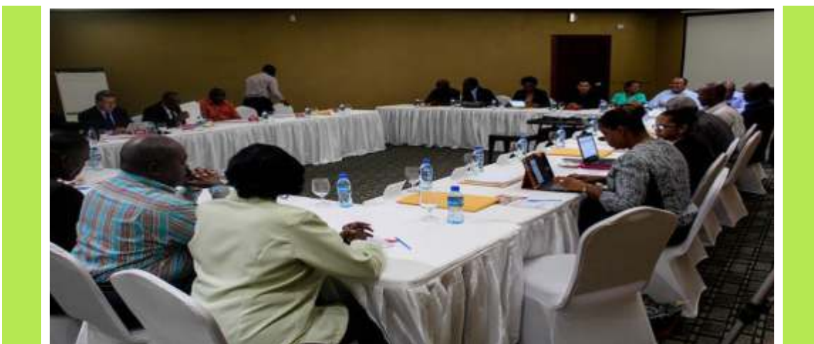
Figure 1: Second Face-to-Face Meeting of the Board of Directors-Paramaribo, Suriname, October 2015