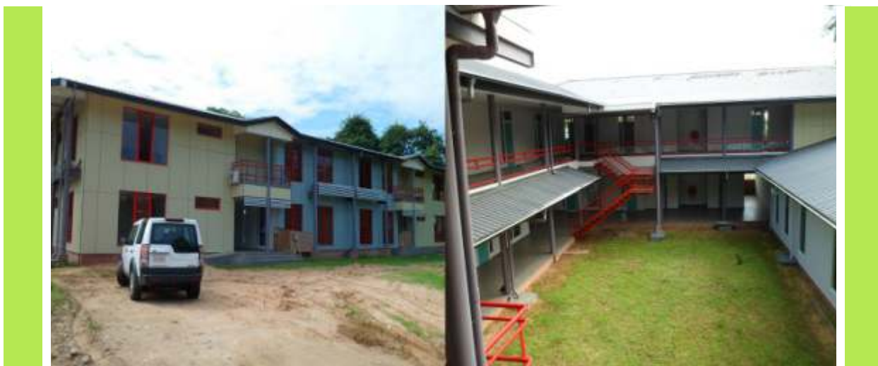
Figure 13: Headquarters of CAHFSA, Paramaribo, Suriname

During the month of February 2015, a three-year operational plan was finalized for the period 2015- 2017. This Plan sought to harmonize laws, standards, procedures and other administrative practices in agricultural health and food safety used by Member States with internationally accepted guidelines, standards and legislative practices and to put in place a support mechanism that will enable countries to implement these laws and standards thus meeting their obligations under the WTO- SPS Agreement and the Revised Treaty of Chagaramas.