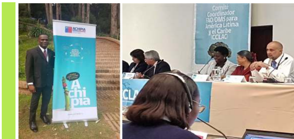
Figure 8: Animal Health Specialist at CCLAC-22, November 2016

In November 2016, the FAO/WHO Coordinating Committee for Latin America and the Caribbean (CCLAC) held its Twentieth Session in Viña del Mar, Chile which was attended by the Animal Health Specialist.