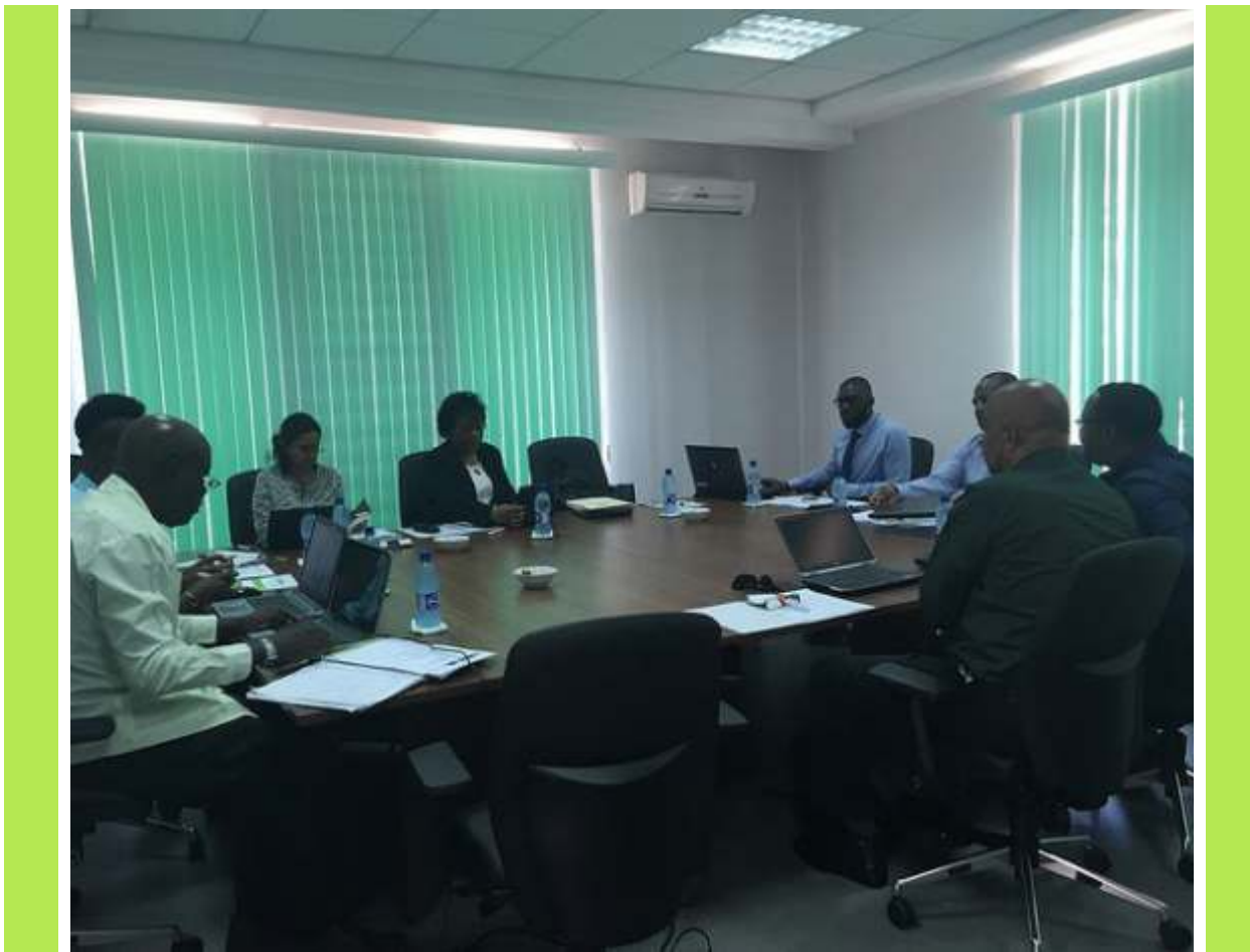
Figure 10: Meeting of AHFS Thematic Group, Paramaribo, Suriname

CAHFSA has been collaborating with the CPHD in undertaking its programme of work to assist Member States in preparing their national priority pest lists. Training workshops on the use of the Analytical Hierarchal Process for pest prioritization, as adopted and validated by CPHD have been conducted in Antigua and Barbuda June 20-21, 2016 and in St. Lucia, August 29-30, 2016