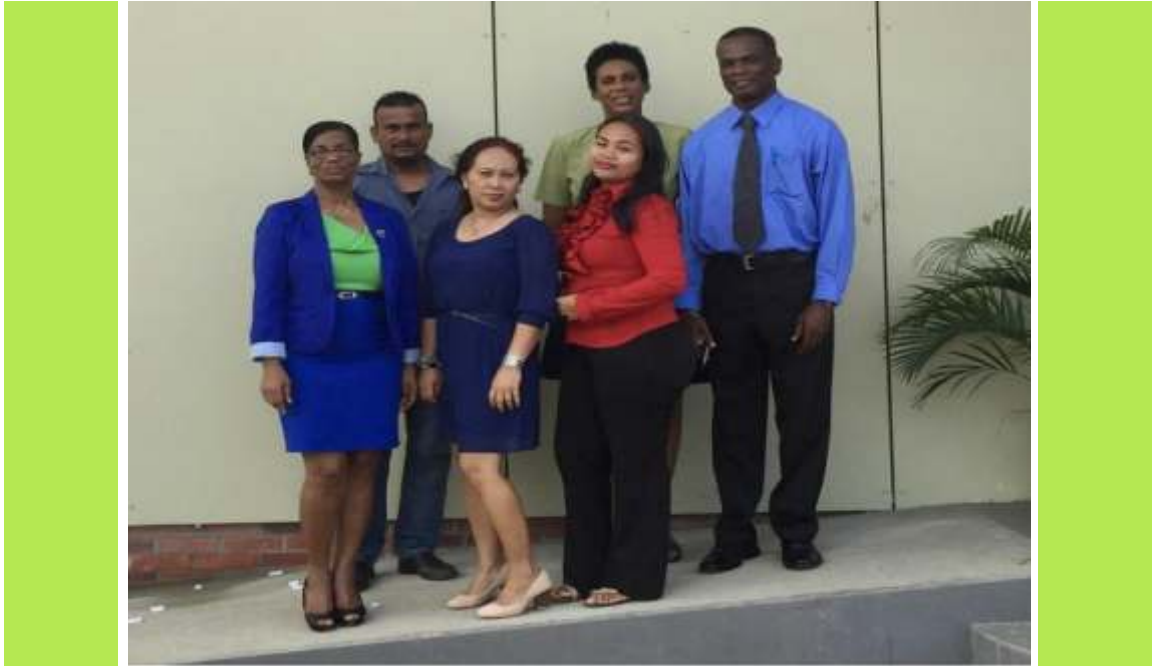
Figure 3. CAHFSA Staff Members-Opening of Headquarters. Paramaribo, Suriname. December 20, 2015