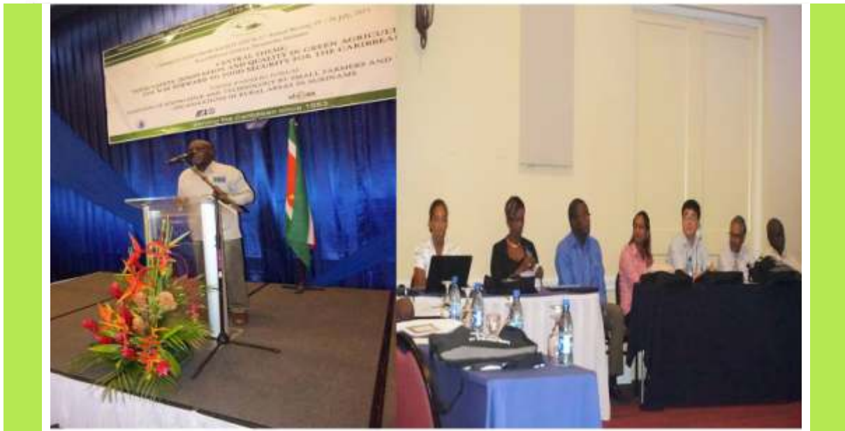
Figure 14: CEO delivering presentation at 51st CFCS Meeting, Suriname 2015

Personnel from the public and private sector in Suriname visited the office of CAHFSA to obtain information on its role and function. These included the CARICOM Division of the Ministry of Foreign Affairs and the local Manufacturers Association as well as some farmers group. The CEO has also participated in a number of regional meetings, making presentations and updating participants, so that the voice of CAHFSA is heard. In addition, the CEO spoke at a Farmers' Forum organized by the Caribbean Food Crop Society.