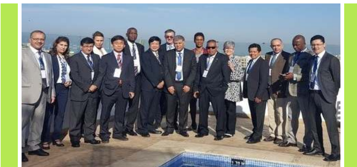
Figure 6: Plant Health Specialist attending 28th TC-RPPO, Rabat, Morocco. November 2016

In November 2016, CAHFSA was invited by the IPPC to observe the 28th Technical Consultation among RPPOs which was held in Morocco. The Institution, which was represented by the Plant Health Specialist was asked to provide an update on the status of the Caribbean RPPO as well as to deliver a short presentation on CAHFSA and plant health activities in the region.