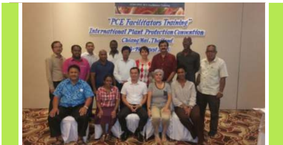
Figure 5: PCE Facilitators' Training. Chaing Mai, Thailand. August 8, 2016

In November 2016, CAHFSA was invited by the IPPC to observe the 28th Technical Consultation among RPPOs which was held in Morocco. The Institution, which was represented by the Plant Health Specialist was asked to provide an update on the status of the Caribbean RPPO as well as to deliver a short presentation on CAHFSA and plant health activities in the region.