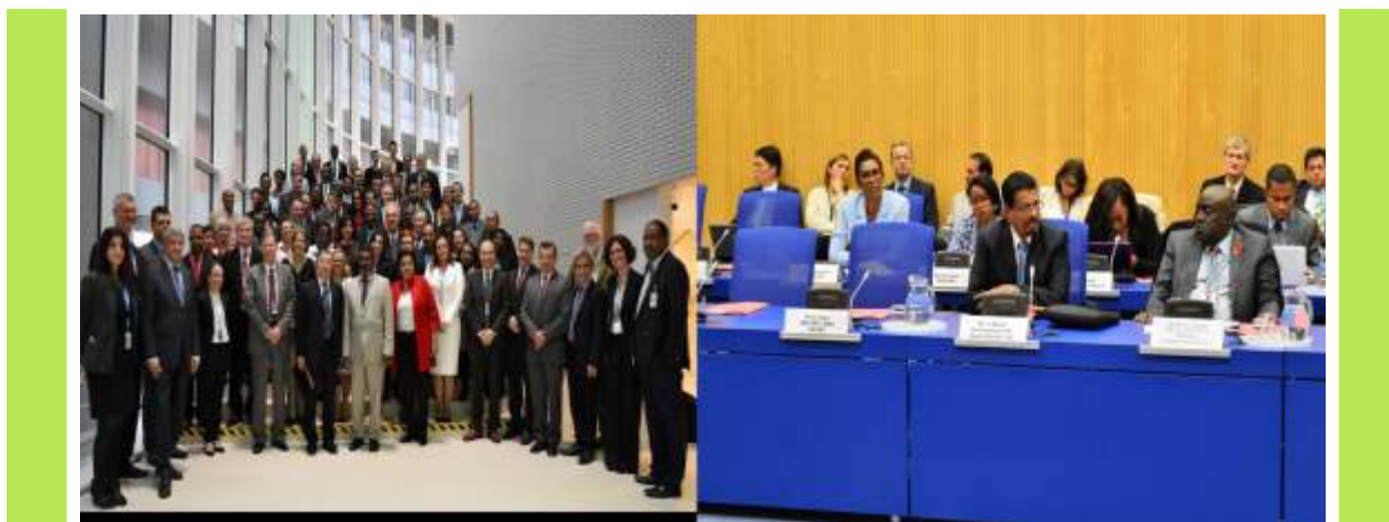
Figure 9: Plant Health Specialist attending IAEA Inter-Regional Meeting. Vienna, Austria. Nov. 2016

CAHFSA, which was represented by the Plant Health Specialist, participated in its capacity as an institution of the Caribbean Community with interest in areas relevant to the technical cooperation (TC) programme and with the understanding that the IAEA TC programme will be executed through regional institutions.