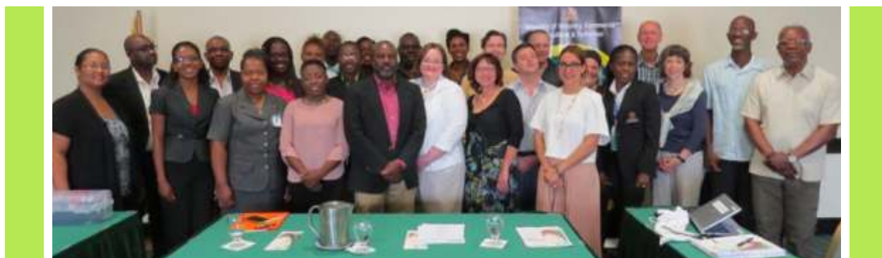
Figure 4: TPDP 2016. Opening ceremony, Montego Bay Jamaica. July 11, 2016

The Plant Health Specialist, as a member of the Technical Panel on Diagnostic Protocols (TPDP) of the IPPC attended the 2016 face-to-face meeting in Jamaica, July 11-15 2016. The meeting was attended by seven TPDP members (Australia, Canada, France, Jamaica, New Zealand, Netherlands and USA), as well as the TPDP Steward, one invited expert (EPPO), two representatives from the host organization, and two representatives from the IPPC Secretariat. The panel intensely discussed four draft diagnostic protocols: Candidatus Liberibacter spp. on Citrus spp. Puccinia psidii , Begomoviruses transmitted by Bemisia tabaci and Xylella fastidiosa .