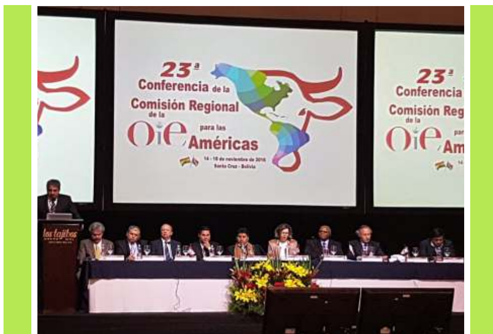
Figure 7: 23rd Conference of Regional Commission of the OIE