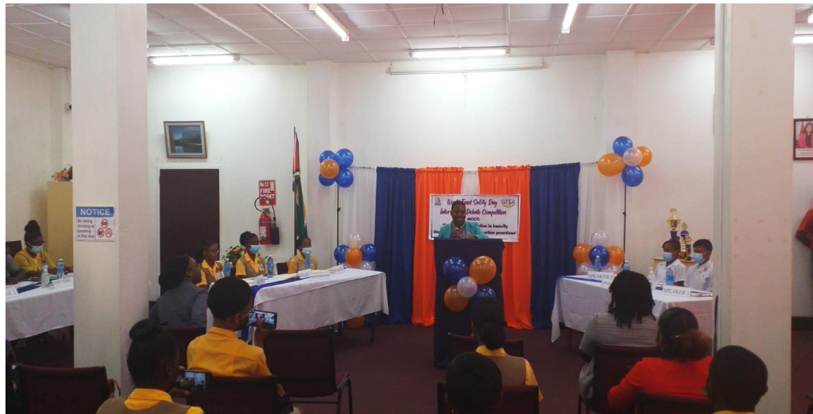
Interschool Debate Competition

Recently, Guyana conducted a number of activities locally to promote the NCC and provide awareness on Food Safety.