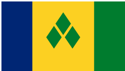
Saint Vincent and the Grenadines