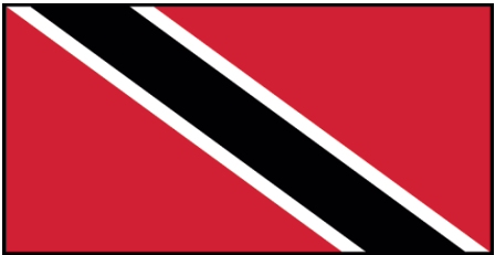
Trinidad and Tobago